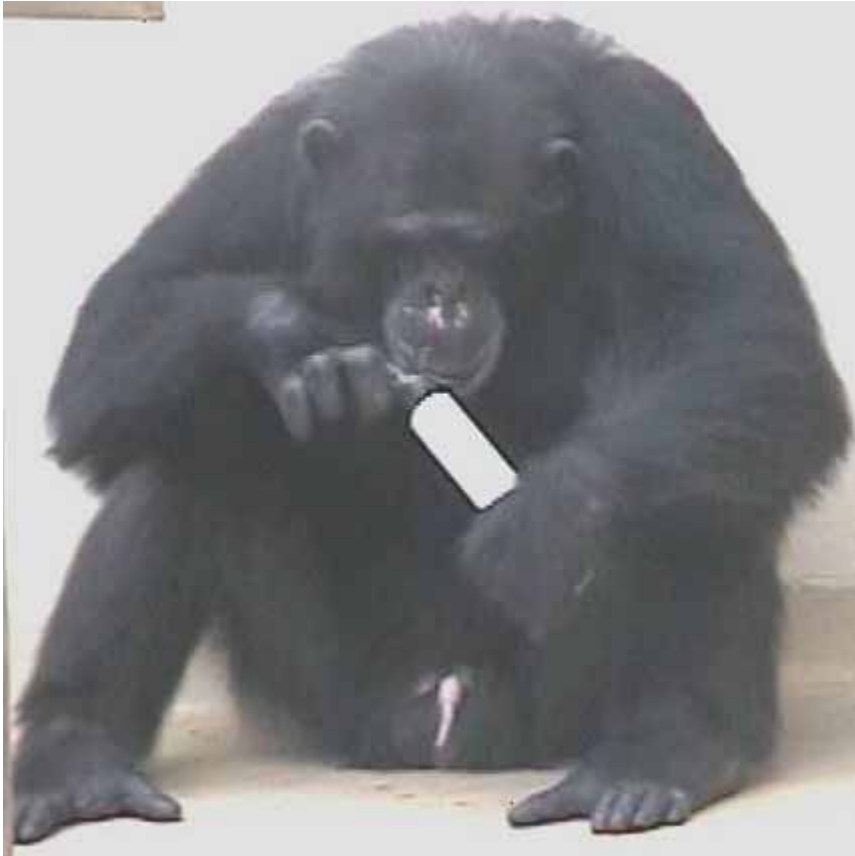
Figure 1. Chimpanzee doing the tube task.

rotation of the tube, a change in bout was only recorded when the tube was physically rotated and not when the subject simply rotated their wrist in order to access the peanut butter in the tube. At the end of testing, the total number of left-and right-handed bouts was summed across the eight test sessions.